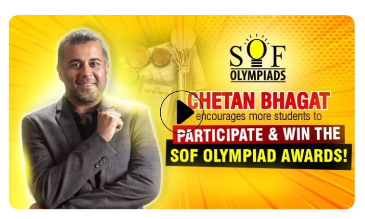
Here's How Chetan Bhagat Encourages more people to participate and win the SOF Olympiad Awards!