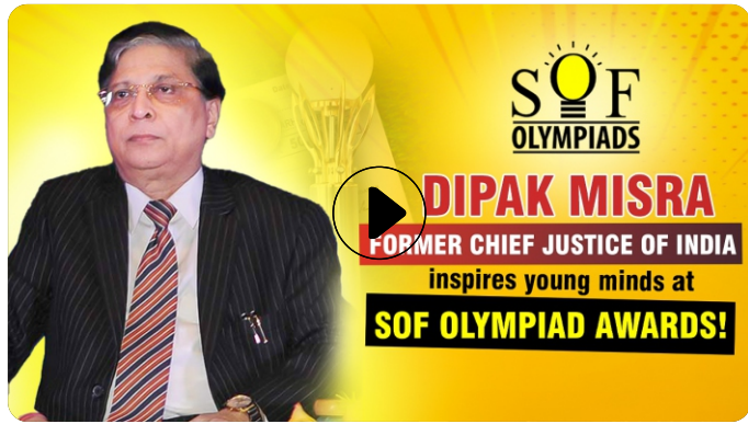
Dipak Misra – Former Chief Justice of India inspires young minds to win the SOF Olympiad Awards!